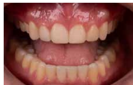
Fig. 6: Intraoral mock-up of the computer-assisted restorative design.