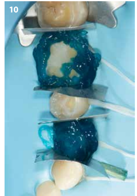
Fig. 10: Teeth were separated with metal matrices prior to sandblasting and selective enamel etching.