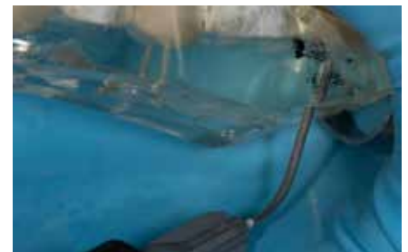
Fig. 16: ... and all done over to build up the other quadrants.