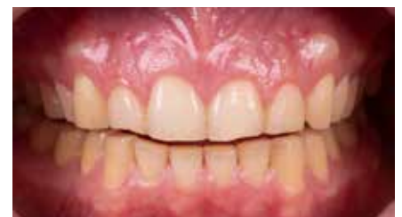
Fig. 1: Microlayered zirconia crown (MDT Roberto Della Neve) Fig. 1: Initial situation, frontal view.