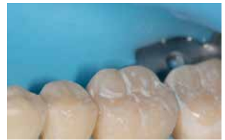
Fig. 15: All steps were repeated with the second silicone key