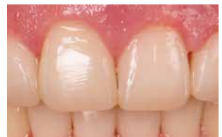
Fig. 18: The layer line pattern copied from the 3D printed model can be removed with simple polishing procedures.

structure needs to be preserved. 15 The composite injection technique fulfils all these requirements. The treatment is minimally invasive, with minimal preparation requirements and an easily repairable material. 16,17 Moreover, adjustments can relatively easily be made in a later phase if necessary,