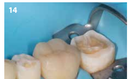
Fig. 14: After injection of the first silicone key (G-ænial A'CHORD, Shade A2)