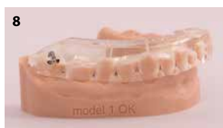
Fig. 8: Silicone keys from transparent silicone (EXACLEAR, GC): models were made for each quadrant and carefully trimmed, not to interfere with the rubber dam isolation.