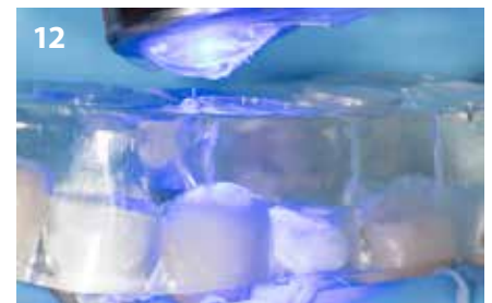
Fig. 12: Each tooth was cured for at least 40 seconds.