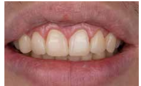
Fig. 19: Treatment result. With careful treatment planning and a reliable procedure, excellent morphology and balanced occlusal contacts were obtained with direct composite.