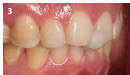
Fig. 3: Composite jig to determine the centric occlusion at the desired VDO.

Another method would be to use a leaf gauge (Fig. 4); in general, a 5 mm maximum increase in VDO can be justified to provide adequate space for the restorative material and to improve the aesthetics. Signs and symptoms after an increase below 5 mm tend to be self-limiting. 7,8 By letting the patient move the mandible first forward and then back, the centric relation can be accurately obtained. With the anterior jig, the mandible