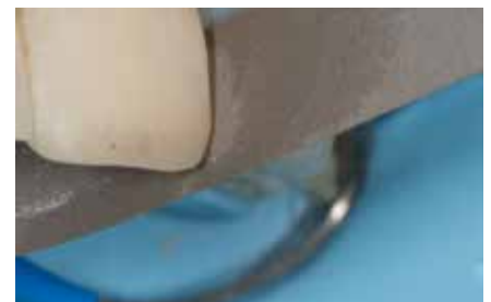
Fig. 17: Finishing with scalpel (blade nr. 12) and interdental strips (New Metal Strips, GC).