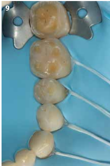
Fig. 9: The teeth were isolated with rubber dam prior to the adhesive procedure.

Prior to the polishing, the sprue and surface irregularities due to composite overflow were removed with abrasive disks, fine diamond burs, interdental strips, and stones (Fig. 17). The occlusion was carefully checked, and premature