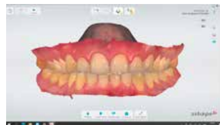
Fig. 5: Intraoral scans of the initial situation.