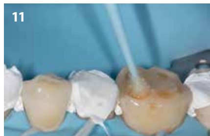
Fig. 11: Adhesive procedure with a two-step self-etch bonding system after careful placement of PTFE tape on the neighbouring teeth and in the interdental spaces.