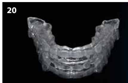
Fig. 20: Occlusal night guard.