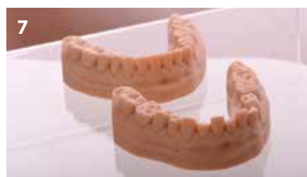
Fig. 7: 3D-printed models: one alternately restored and one fully restored model.

For each jaw, two models were printed: one of the complete digital design and one where the teeth were alternately built up and the other teeth were left as in the original situation (Fig. 7). Making use of these alternated models improves the stability of the transparent