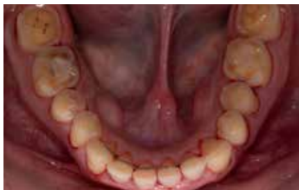
Fig. 2: Initial situation, intraoral view.

restorations standing proud. Clearly defined, glossy wear facets were also present, indicative of excessive attrition.