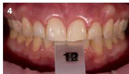
Fig. 4: A leaf gauge can also be used to determine the increase in VDO.